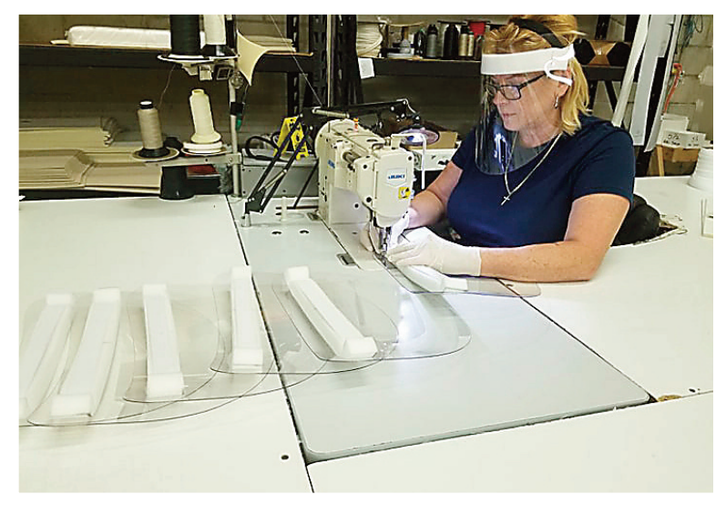
A fabricator at RCM Fabrics producing protective face shields like the one she is wearing.