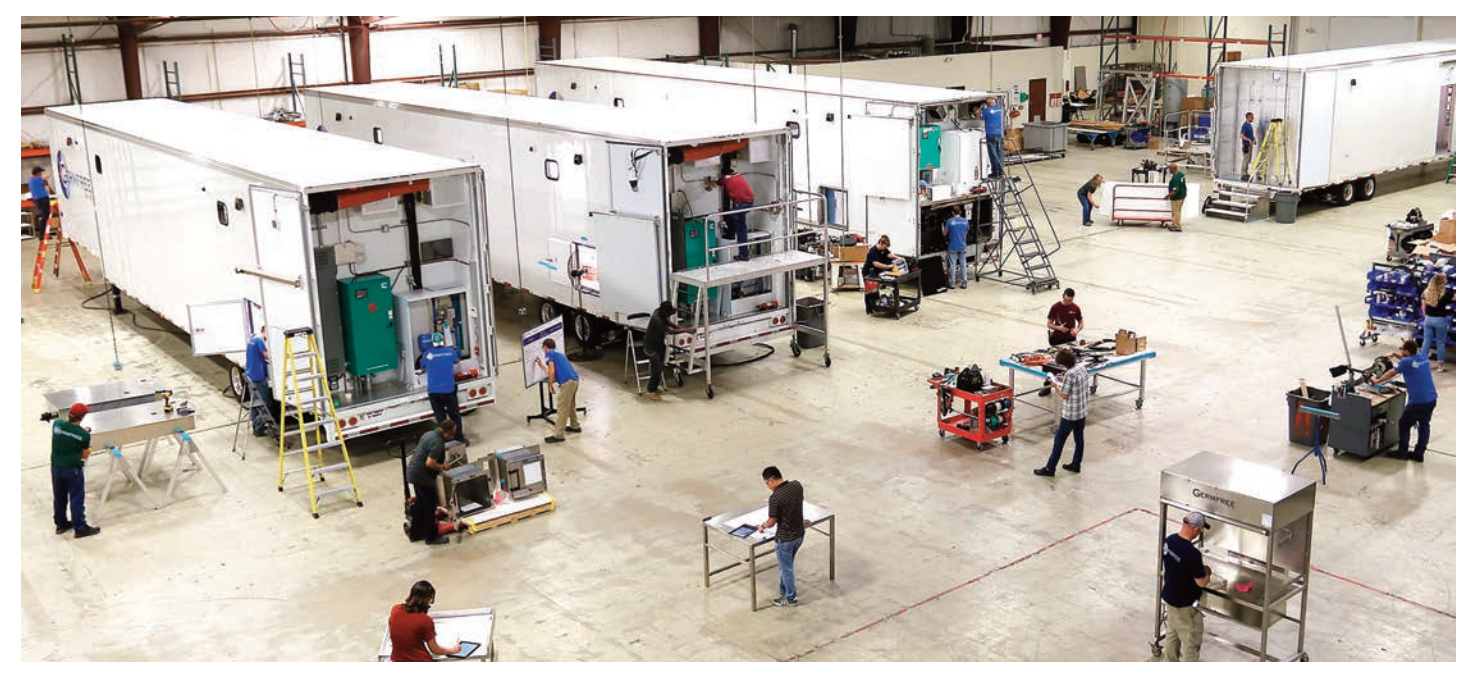
Germfree Laboratories continued design and manufacturing operations under modified circumstances to help protect workers from the COVID-19 virus.

Germfree Laboratories is no stranger to meeting urgent needs within the medical, pharmaceutical and laboratory research communities. In fact, the Ormond Beach company has been producing state-of-the-art bio-isolation and control solutions for nearly 60 years. Over that time Germfree products have been enlisted to help fight global health security threats such as SARS, MERS, Ebola, Avian Influenza and others. So today it is no surprise that the company is fully engaged in the war on COVID-19.