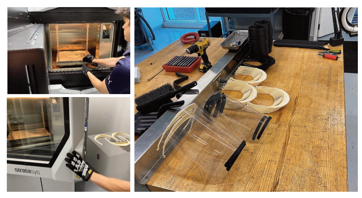
3-D printers at NASCAR's Research & Development Center in Charlotte produced thousands of protective face shields that were shipped across the country.

The roar of motorcycles typically fills the stadium at Daytona International Speedway (DIS) during annual Bike Week festivities in March. The coronavirus put the brakes on all public events at DIS and other stadiums around the world, but the closed stadium was the perfect setting for major relief efforts in the fight against COVID-19.