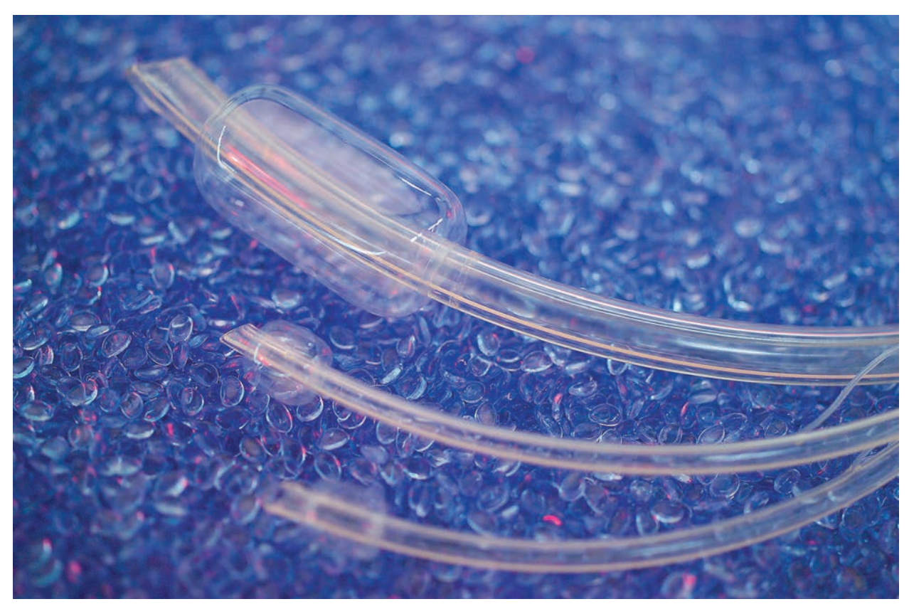
Command Medical Products endotracheal tubes used in the intubation process.

The soaring demand for lifesaving ventilators came into sharp focus as the effects of a new coronavirus strain spread across the globe and overwhelmed hospitals. Few were prepared for the highly contagious COVID-19 virus and the deadly effect it had on pulmonary function where, for many patients, immediate ventilator use was the only solution. Hospital demand quickly outpaced supply, and that meant manufacturers like Command Medical Products had to step up to support the production of these critical devices.